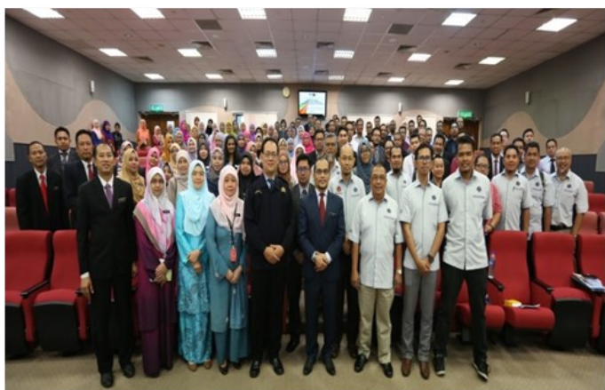
Group photo of participants and speakers form Majlis Keselamatan Negara for Sesi Pemukiman Peman-

A total of 780 participants attended the courses for the period of January to June 2018. On an average, the assessment of the effectiveness of the courses assessed by participants is 91.15%. The lowest marks is 87.0% and the highest mark is 94.7%. New courses have also been introduced in 2018 such as Kursus Setiausaha Hebat , Program Bicara Ilmu , Problem Solving & Thinking Skills and Seni Pengacaraan & Pemudahcara