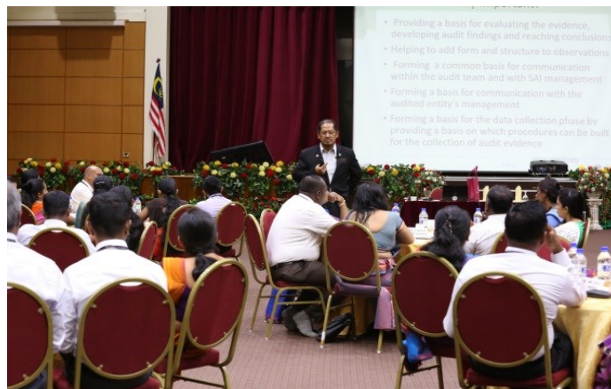
Lesson session at Auditorium Ahmad Noordin, National Audit Academy

A total of 240 participants attended the Performance Audit Training Programme Auditor General's Department of Sri Lanka. On an average, the assessment of effectiveness of the courses assessed by participants in 87.13%. The lowest mark is 82.2% and