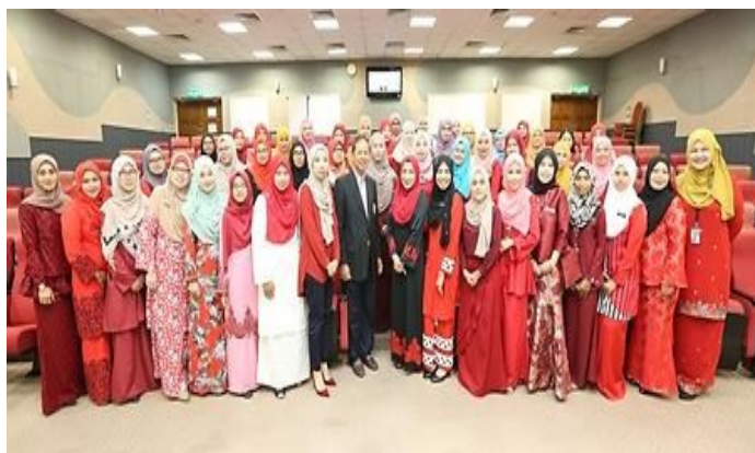
Group photo of the secretaries and the speaker for Kur-sus Setiausaha Hebat