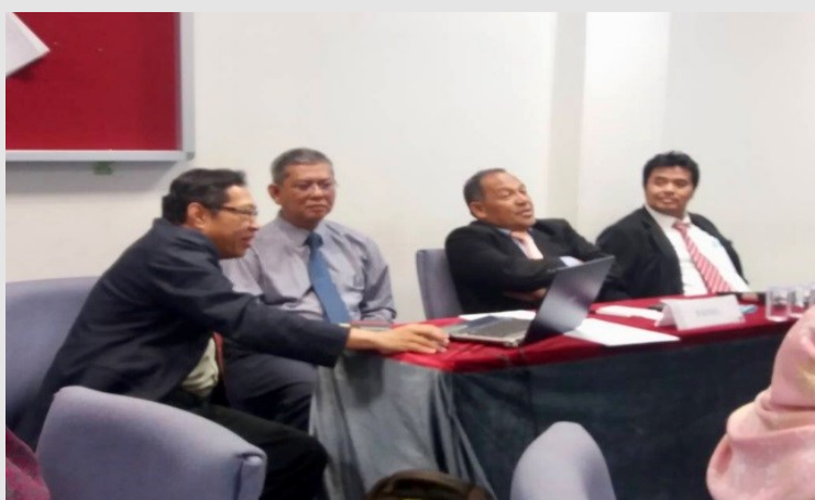
Panel of evaluators for the Financial Statement Workshop on SPEKs