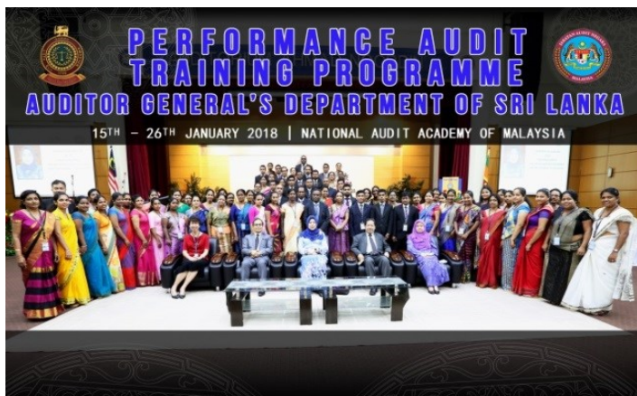
Group Photo of Sri Lanka Delegation

The International Programme and Coordination, NAA has targeted to implement 5 International Courses for 2018. However, in early January, NAA had received a request from Auditor General's Department of Sri Lanka to train their auditors on the Performance Audit. For the period of January to June 2018, 3 courses were conducted and another 4 will be conducted from July to December as shown in Table 1.