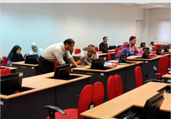
Hands-on teaching method in MS Publisher 2010 Course