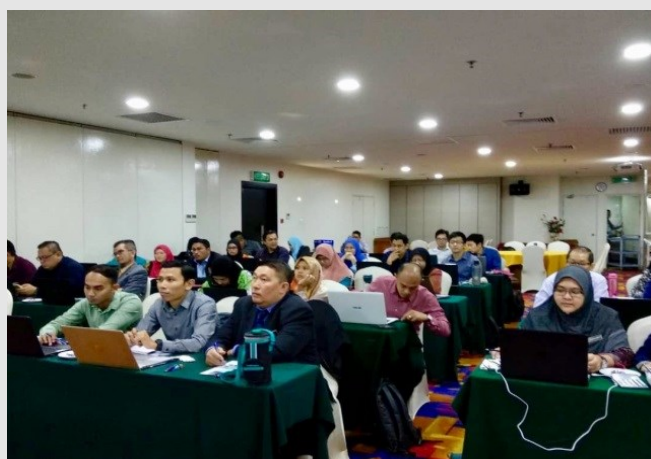
Electronic Working Paper (eWP) Course for the JAN Sarawak

A total of 290 participants attended the courses for the period of January to June 2018. On an average, the assessment of the effectiveness of the courses assessed by participants is 90.13%. The lowest mark is 82.68% and the highest mark is 93.70%.